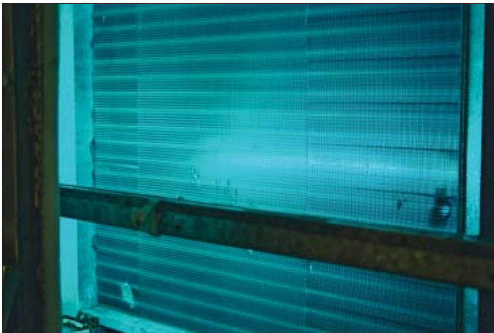
A control unit in one of the early tests, this air handler was later equipped with UVC.

installed the UVC devices more than four years ago. The coil and drain pan areas have also maintained their clean condition, eliminating the necessity for the monthly inspections and twice annual cleanings that used to be required. How is this possible? We have found that the high output UVC energy kills or inactivates both coil and drain pan mold and bacteria (to eliminate their toxins, VOC and spore production, and allergens) as well as ordinary coil and drain pan debris. The result is a continuous form of source control.