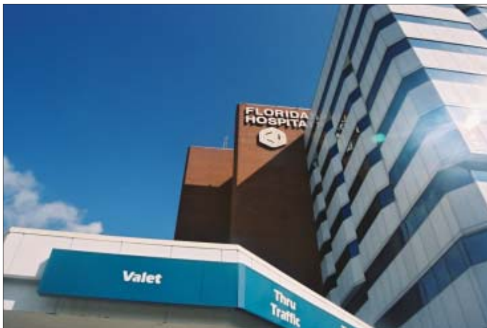
UVC lights have been used in facilities throughout the Florida Hospital system.